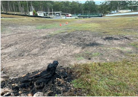
Area where stump has been burnt out and adjacent stump to be also burnt