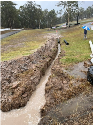
Stormwater flow showing results during downpour