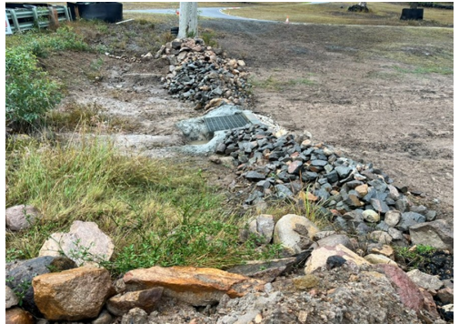
Completed sump and rock wall in gully