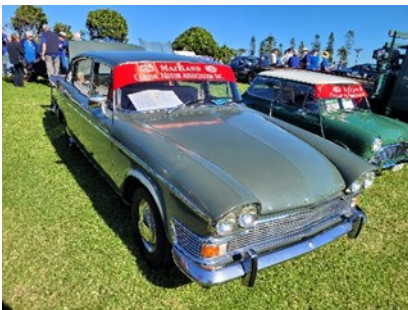
Humber Super Snipe