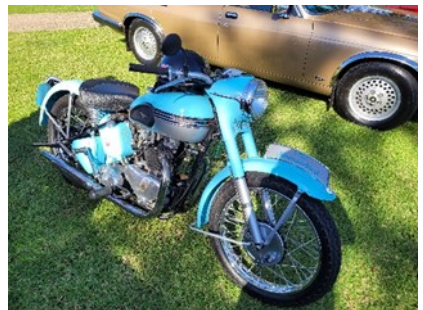
1950 Triumph Thunderbird