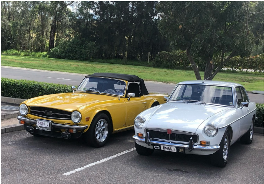
Saturday's Club Run to the Hunter Valley Areas