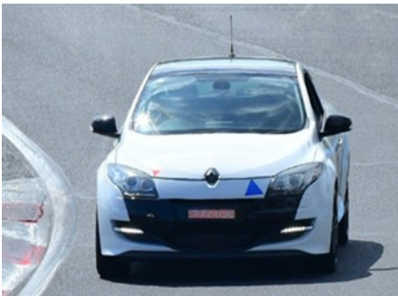
Garry Christopherson only completed 2 runs on Saturday but still managed 4 th in Class and 27 th O/R