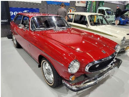
Volvo P1800 Estate

The car show in Sydney had its fair share of exotic sports and muscle cars exuding mega dollar outlays, as expected, but also included some rarely seen road and competition vehicles: