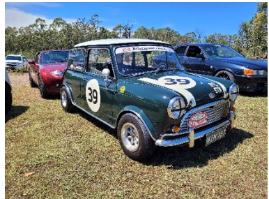
Morris Mini Cooper S

Out for a shake out run following a restoration was this very tidy looking Toyota Corolla Twin Cam. Experienced some minor brake issues on the day but set to give my TR7 a good challenge in the Pre 86 Registered Class in 2026.