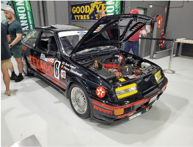
Ford Sierra Cosworth Race Car