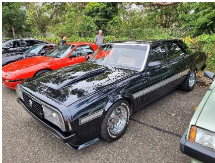
Leyland P76 Muscle Car interpretation