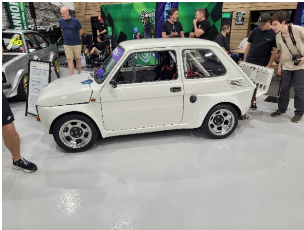
Fiat Niki R-1 Yamaha 650 Competition Car