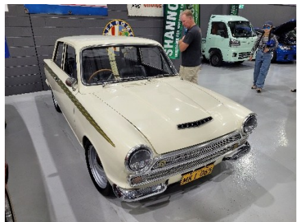
Mk1 Lotus Cortina