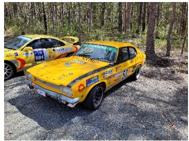
Capri Piranha Rally Replica