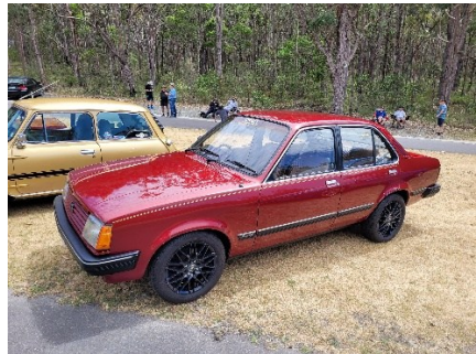
Two beautifully presented Mini Coopers and a Holden Gemini