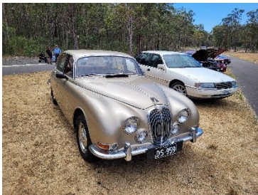
Very original Jaquar Mk2 and an immaculate Alfa Romeo GTA 3.2L V6