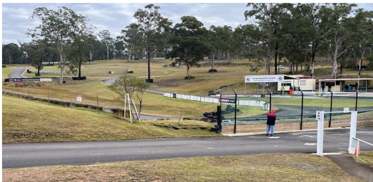
From humble beginnings (left) – to the Ringwood we have today (above).

Remember, early in his career Jack Brabham ran in the King Edward Park Hillclimb in the 1950s when our club was first formed!