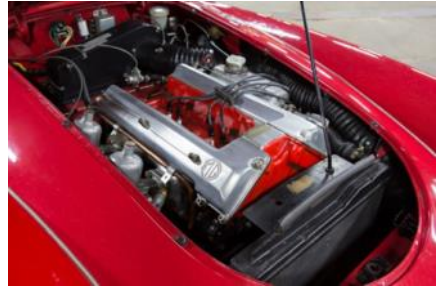
The more common push rod engine version

Jeff Newey had an immaculate black twin cam MGA.'