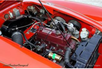
The Twin Cam version