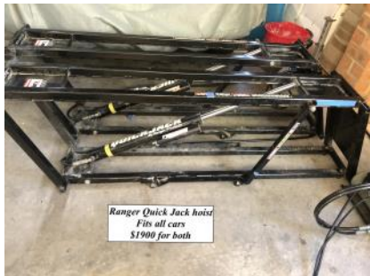
Ranger Quick Jack Price $1900.00