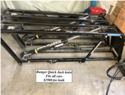
Ranger Quick Jack Price $1900.00