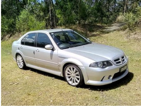
The Starlight Silver MG ZS180 on its first visit to Ringwood.

My car had done just 89,130 Km in the 17 years and 11 months since its build date, I have quite a lot of documentation with the car which indicates that it did spend several years in storage. I have the original copy of the purchase document from McCarroll's MG Rover indicating the on-road cost was $46938.00 on 25/11/2004.