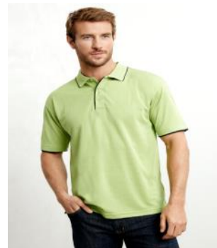
Mens polo Pistachio/Navv