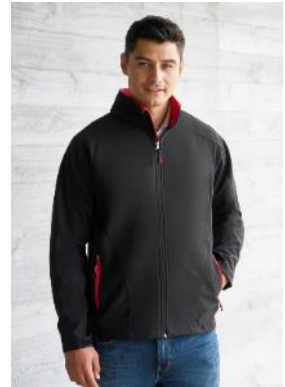
Unisex Pullover Black with red trim

All shirts & Jackets come with the new style Cub Logo embroidered on them & Includes GST.