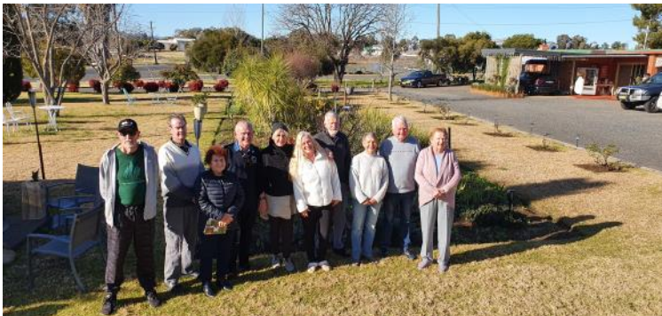
Christmas In July!!! - Quirindi

The Presentation Night & Christmas Party will be held on Friday 9 th December 2022 at Club Macquarie. The cost is $29 per person for dinner and you will need to let me know by 30 th November if you will be attending.