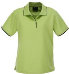
Ladies Polo Pistachio/Navv