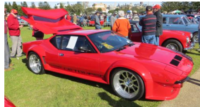
Detomaso Pantera GT