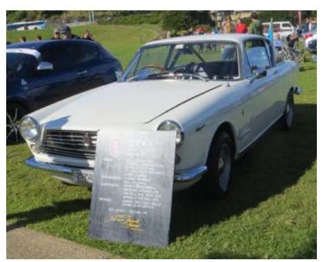
Tom's Fiat 2300S