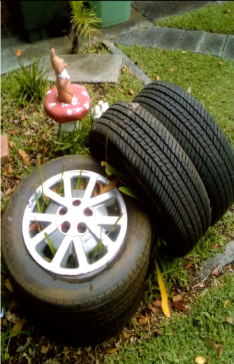
1986 Toyota Celica original 5 stud wheels and tyres. - $150