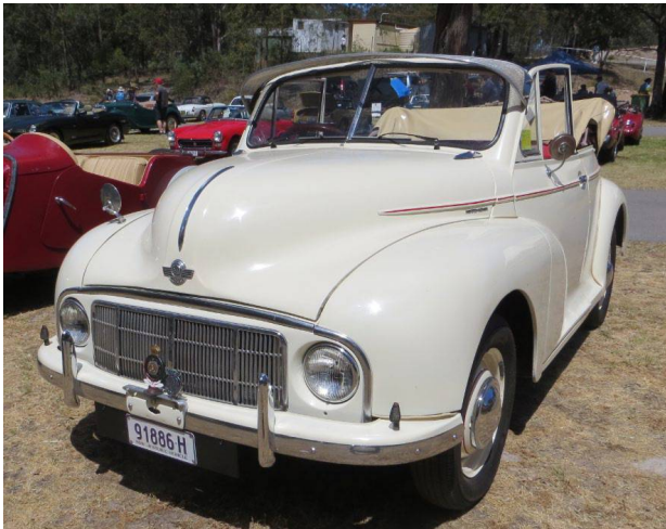
Morris Minor – Low Light - Convertible

As car shows have again been cancelled due to COVID restrictions I have delved back into my archives to continue my theme of rare and interesting vehicles seen at local shows. The three following vehicles came along to our appreciation day at Ringwood last