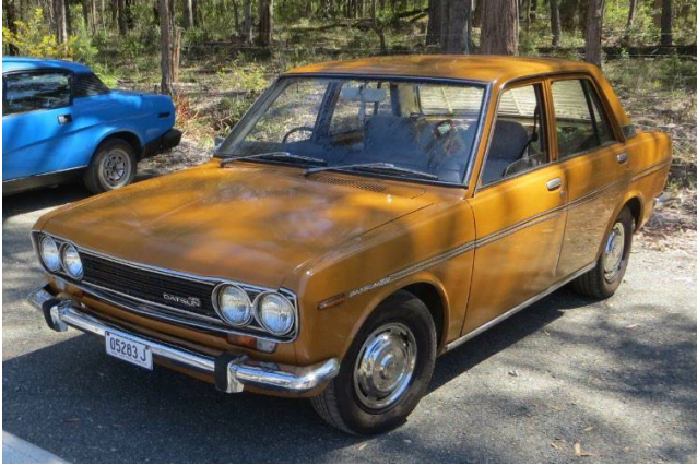
Datsun 1600 a rarity in original condition