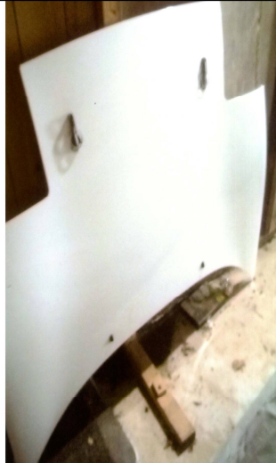
Toyota MR2 Bathurst Model Bonnet with safety pins (as new condition) $200

Contact Barrie Coady on 0408490528 re the above items.