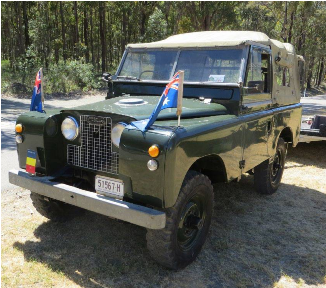
MKI Land Rover

Great to see nicely presented vehicles in original unmolested condition.