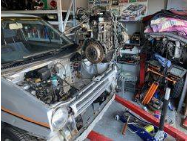
Toby Banks building a fast city!