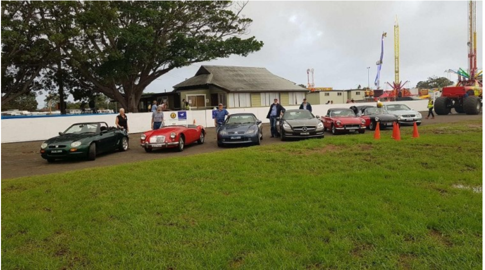
Above: the line-up of cars and drivers for the Newcastle Show