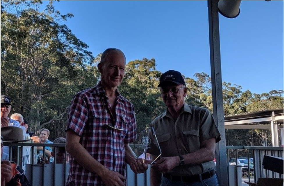
State Hillclimb trophy winners