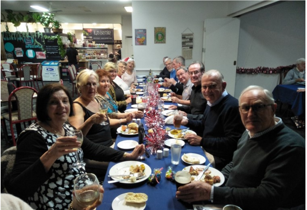
Christmas in July