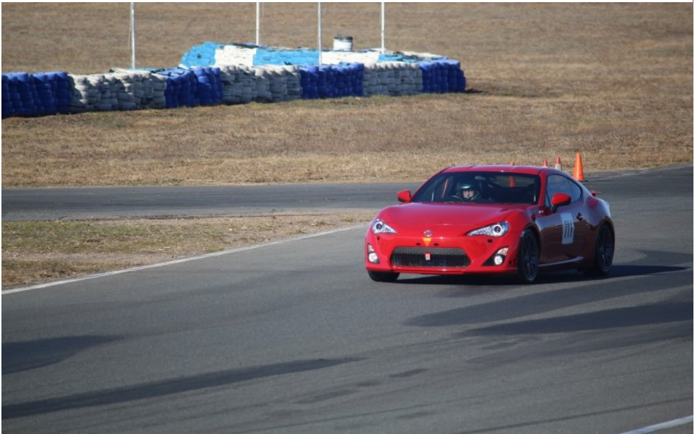
Below: Laurie Movigliatti at CSCA Rd 4, Wakefield Park