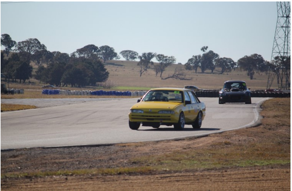
Below: Joanne Garland heading into the last corner at WP