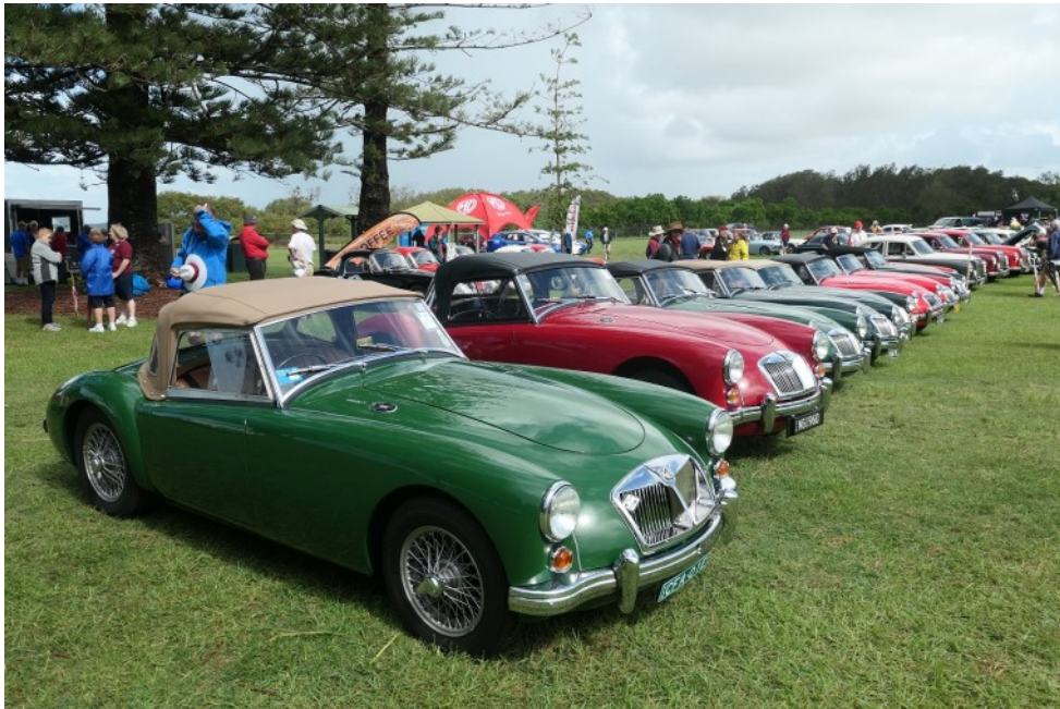
National Meet Concours