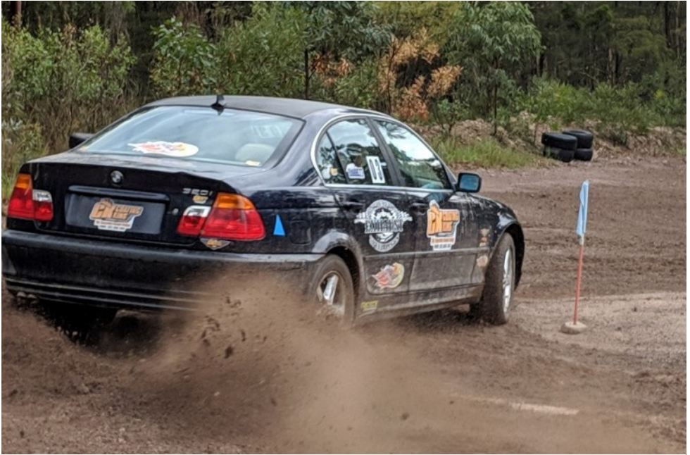
Day/Night Dirt/Tar Khana action