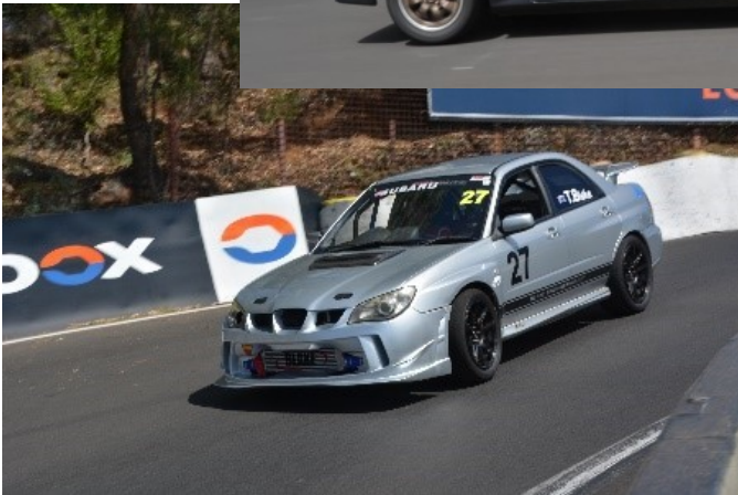
NSW Hill Climb