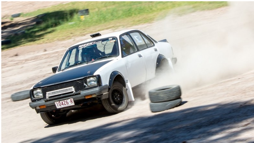
More action from the Khanacross