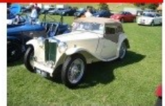
(Cars depicted are not necessarily those on display on the night)

A DISPLAY OF MG VEHICLES Including our members cars and New models from 7.00pm