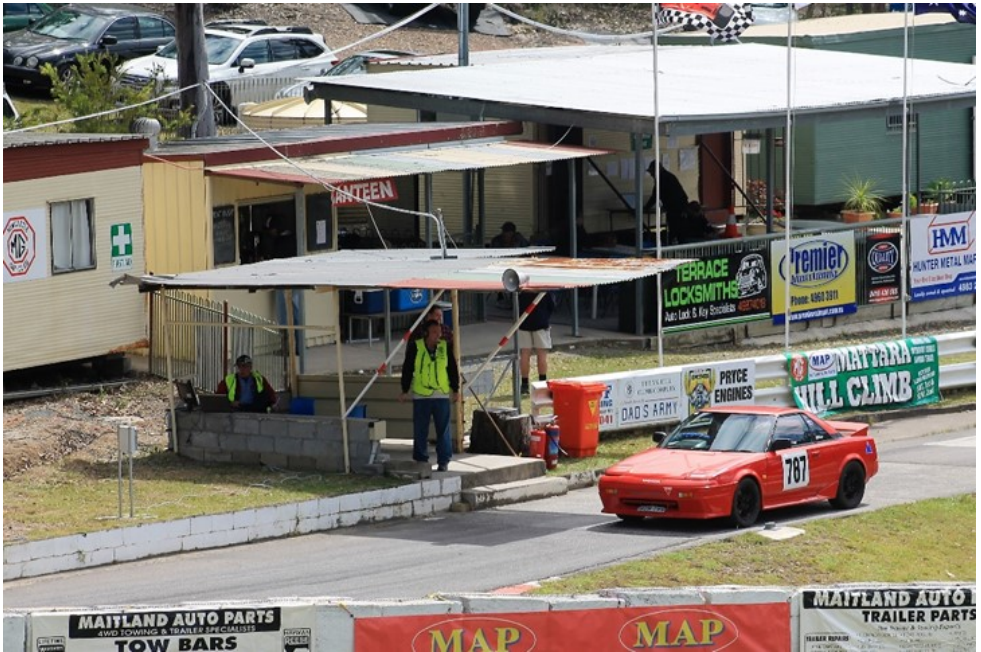
Start Line shelter Pre December 2018