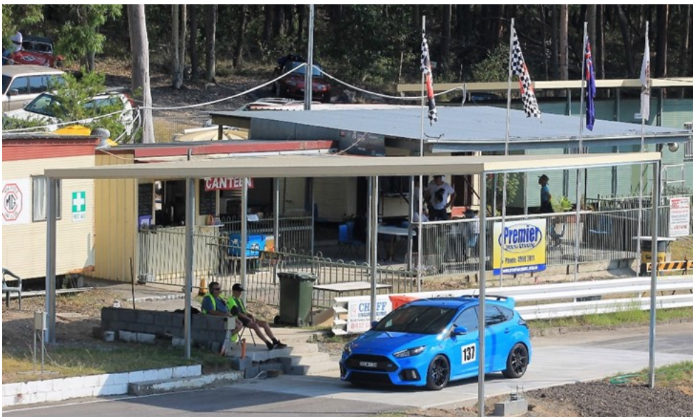
Start Line Shelter January 2019