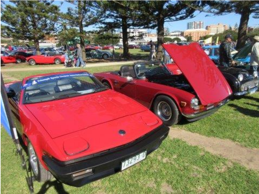
More from the All British Day. Above: a fleet of Triumph sports cars Below: a brace of E's