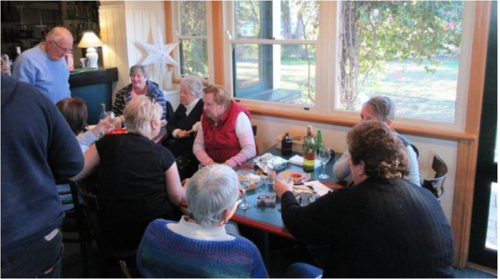
Christmas in July