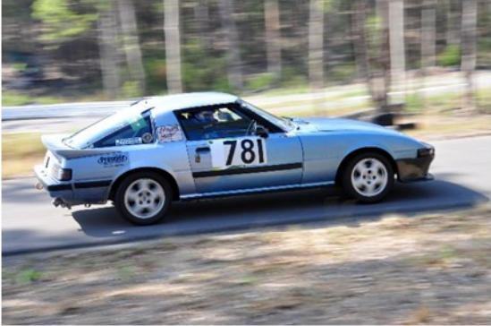
Neville Gregory on his way to setting a new Type 3 Over 2L record of 42.83 sec.

Perhaps we should consider running an event using the same formula with our own members forming teams of 5. I'm sure it would be an interesting experiment.