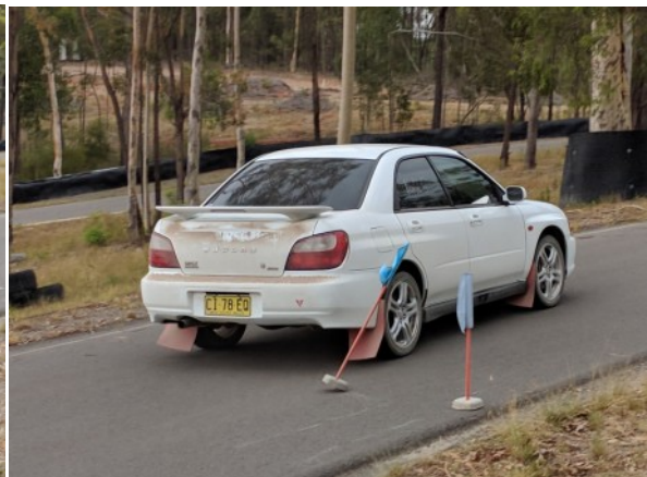
K/C Magic flag! Will it stand up? It did!