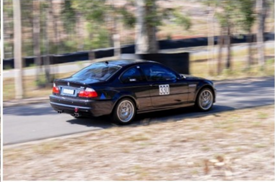
Jeff Schmitt along the top straight to set a new Type 1 Over 2L record of 43.75 sec