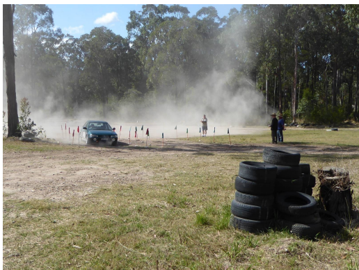
A bit dusty but having a ball