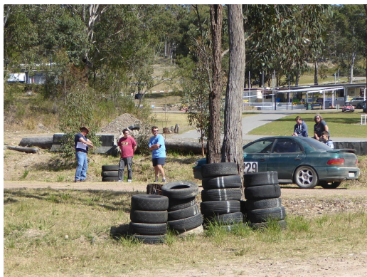
Lining up & ready to check the times!