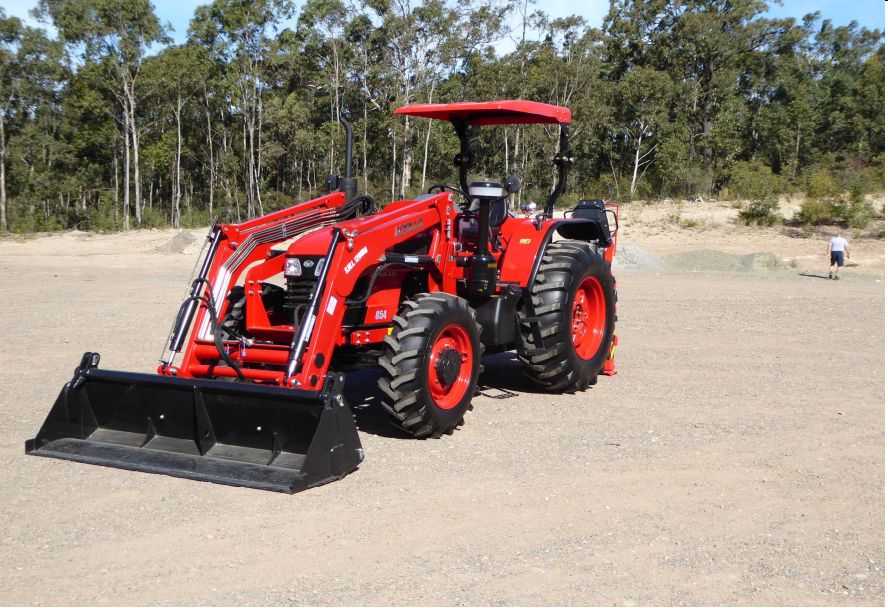
In all its glory, well its the same colour as a Ferrari