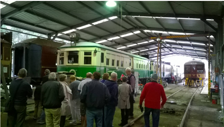
These are boys & girls toys & I mean BIG toys!