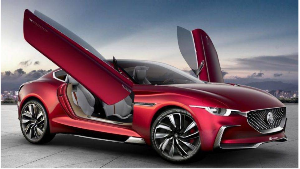
MG E-MOTION ( see page 24)

_WOULD YOU LIKE TO SEE YOUR ADVERT IN THIS SPOT ? ENQUIRE WITH EDITOR