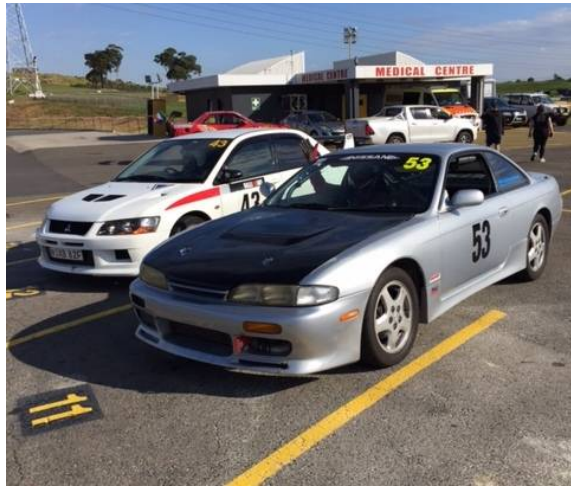
John Garroway Nissan