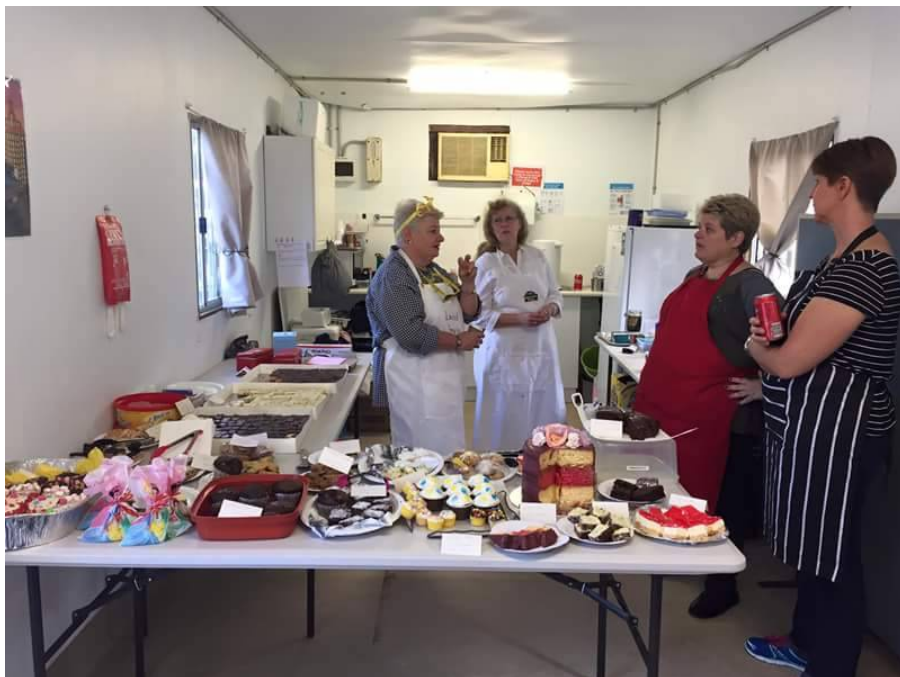
The good ladies helping to make the biggest morning tea such a success