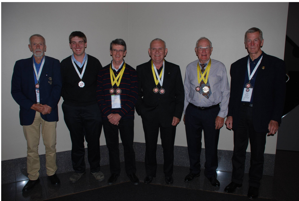
MG NATIONAL MEETING ADELAIDE TROPHY WINNERS