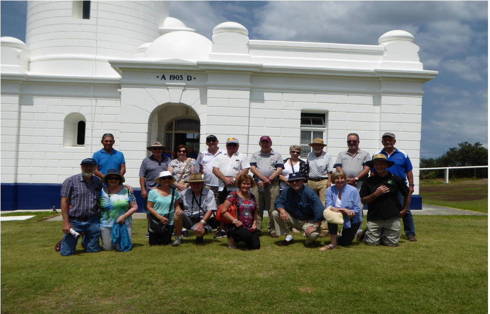
The midweek run crowd Officials get time for lunch!