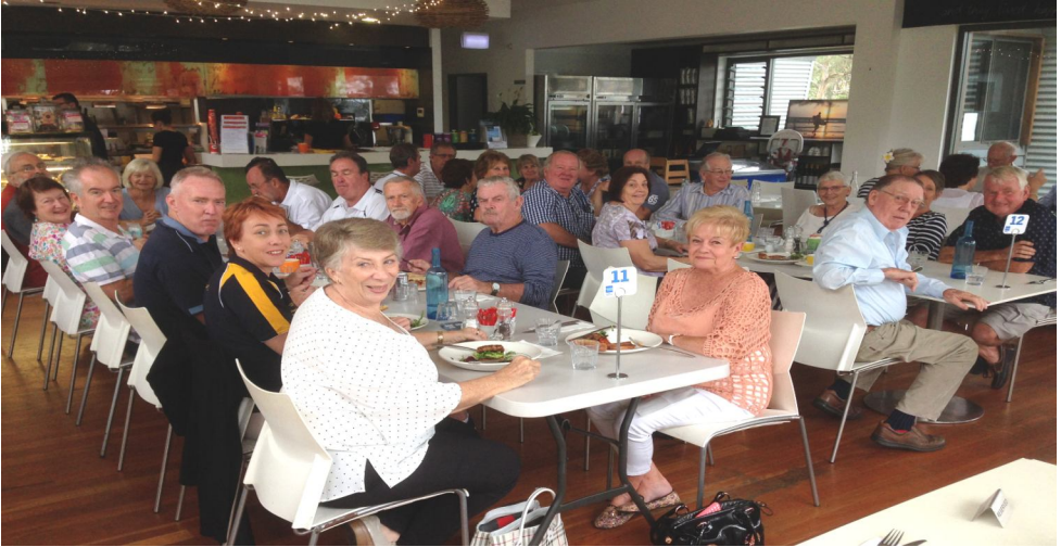
Club run for Australia Day to Murrays Beach