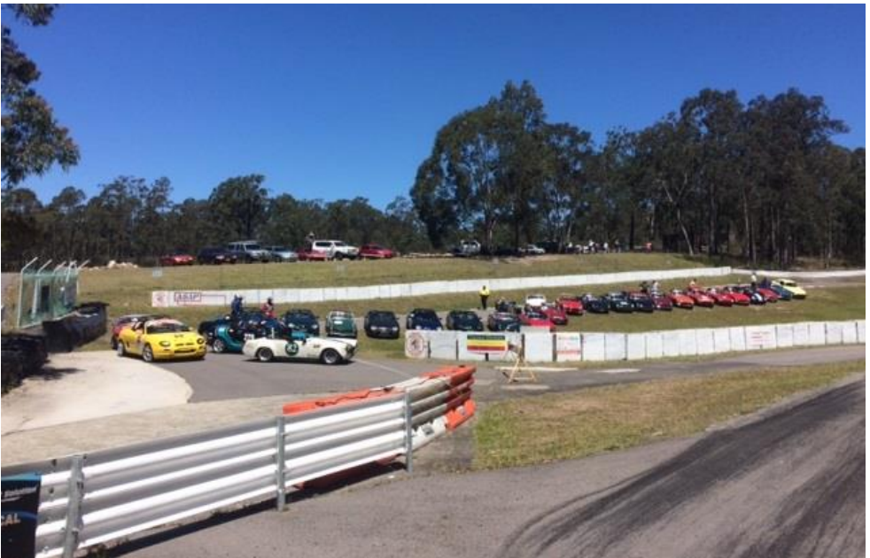
Below: the line up of cars at the all MG event