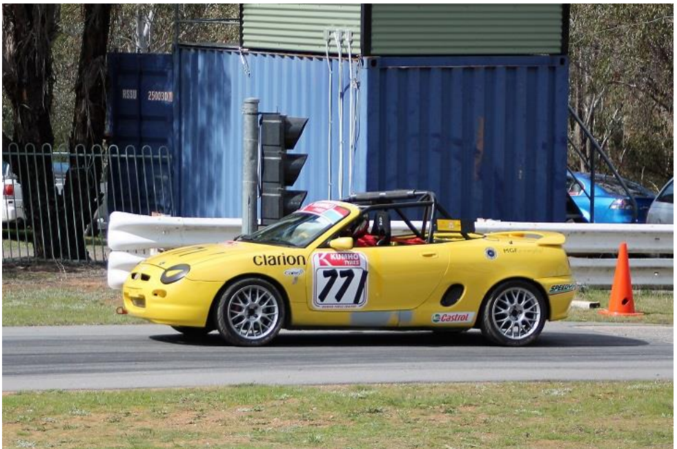
Below: Graeme Semken at Canberra