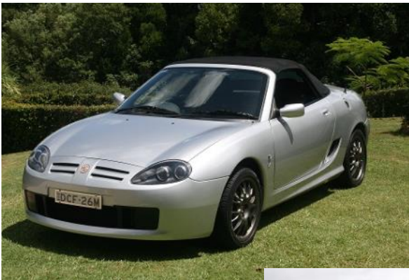
2002 MG TF above 2003 MG TF to the right

As I mentioned, one of these cars has to go, and we will keep the other, so they are both good cars. I suffered a stroke and am in no condition to have 2 cars to look after. We live in Northern NSW and are going to Tasmania for a holiday during June, but anyone can contact us on our mobile phones, 0456740929 or 0458507189 to find out about these two cars.