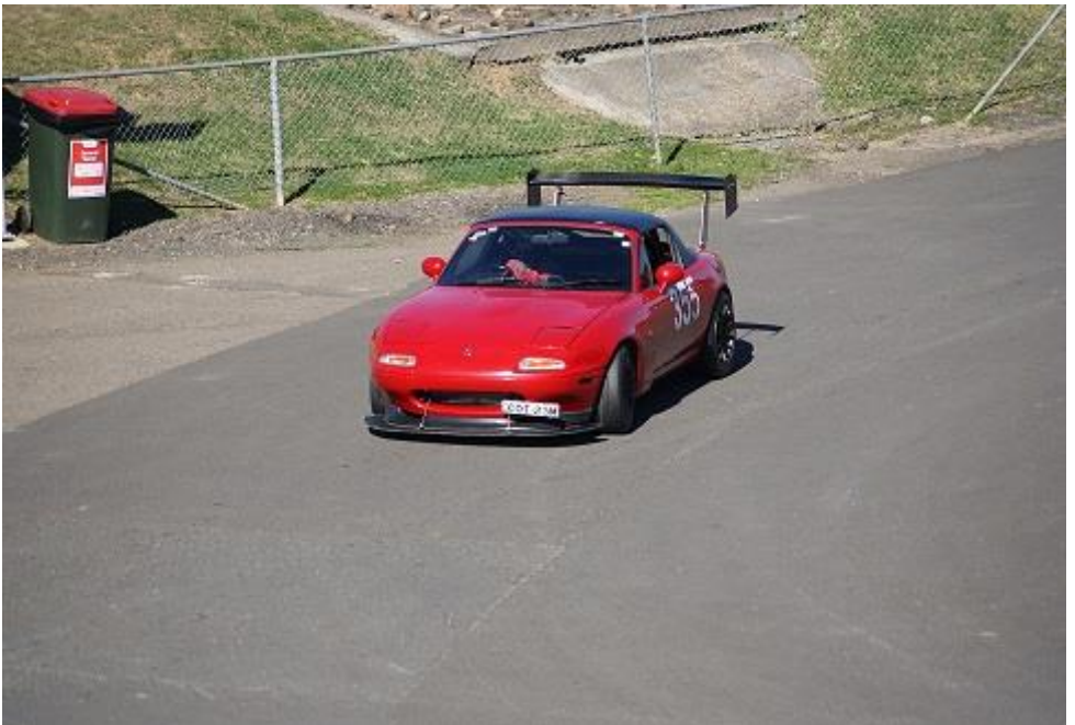
Below; Kendall O'Connor returning from another run at SMSP