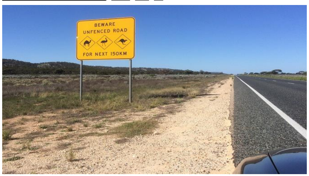
Above: Things to look out for on the road back from WA, look at the quality of that tarmac.

Below: Inspecting Pauls garage at the last Natter Night.