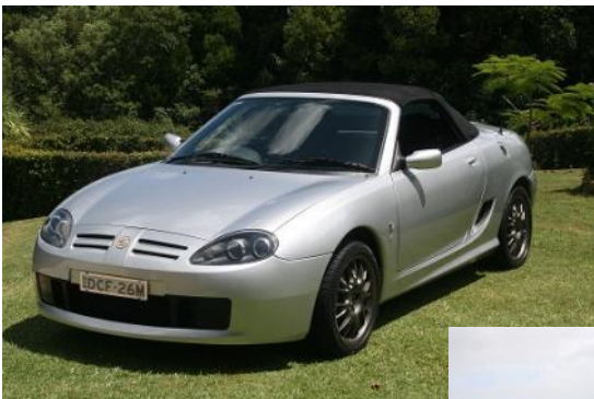
2002 MG TF above 2003 MG TF to the right