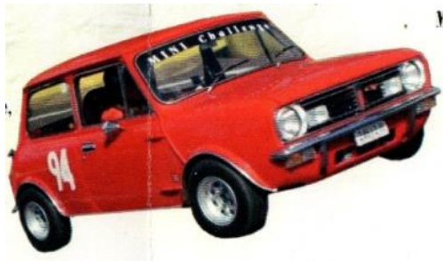
Keve in action