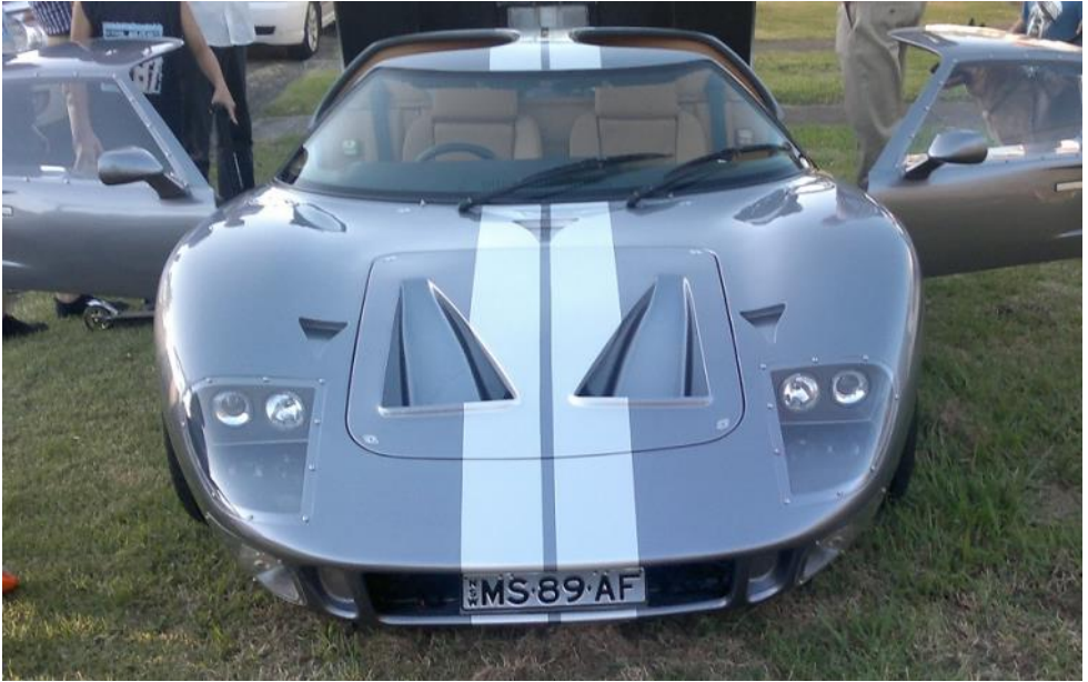
Above and Below —Darrell Peatie’s GT40 at the February Club night. I don’t think the dogs in the bottom corner of the picture below were the only ones panting and salivating.