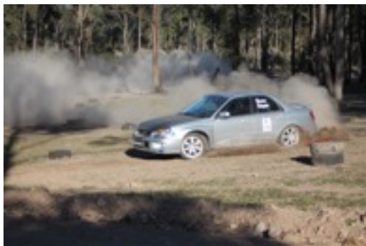
Emma in the Subaru at Ringwood