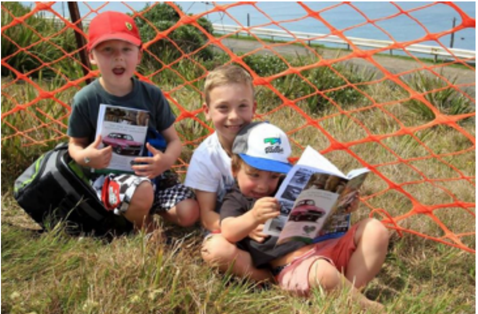
Below: Future hillclimb champions being inspired whilst enjoying the action