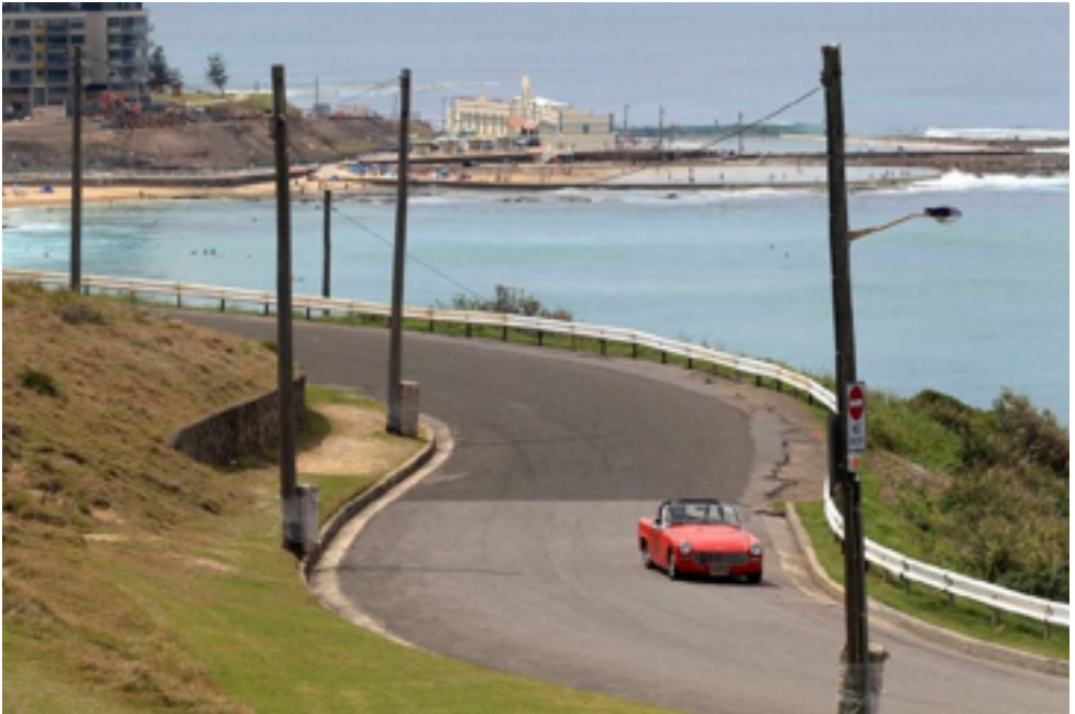
Above: The iconic King Edward Park hillclimb picture with Newcastle beach and ocean baths in the background and a MG Midget (or Sprite) racing towards the hairpin.