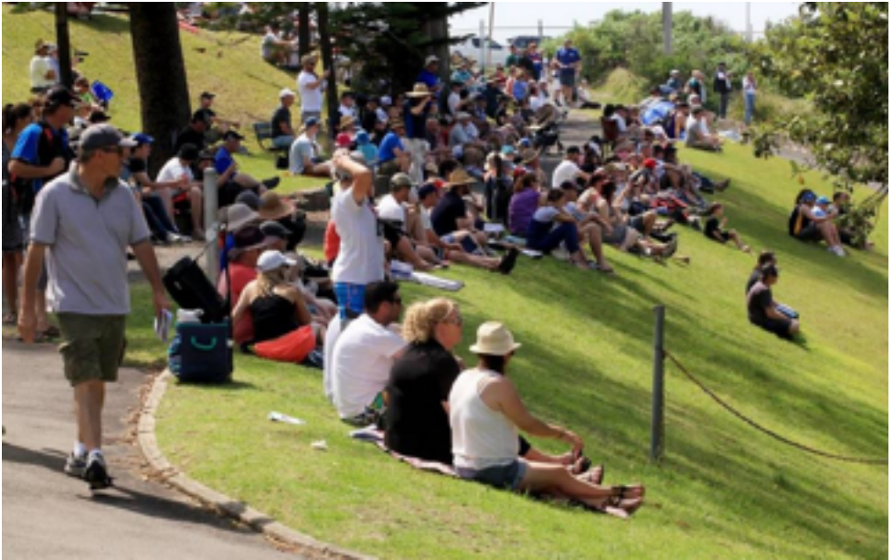
Above: The crowds flocked to the final King Edward Park hillclimb helped by great weather all weekend