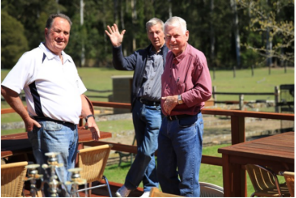
Centre Spread and Inside Back Cover: Photos from the register run to Stroud.