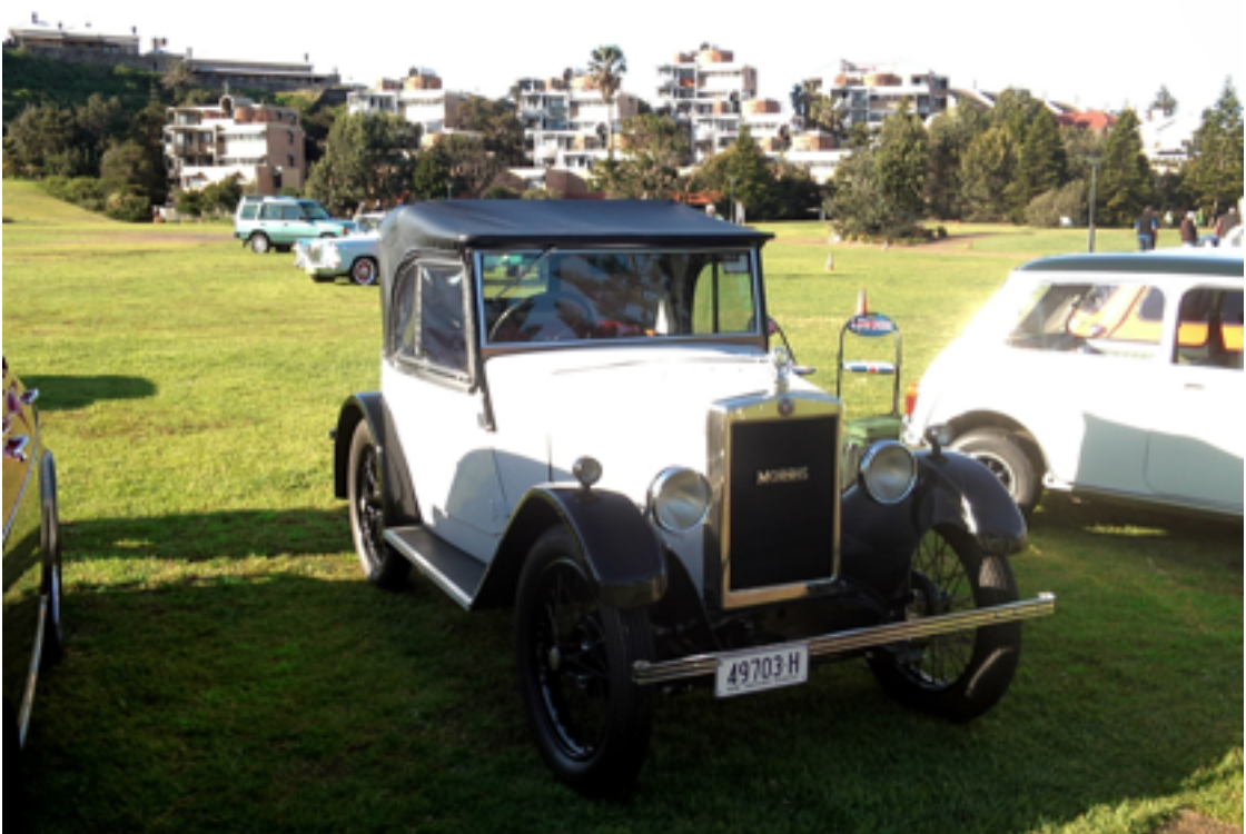
Above: A Morris on display at the All British Day.