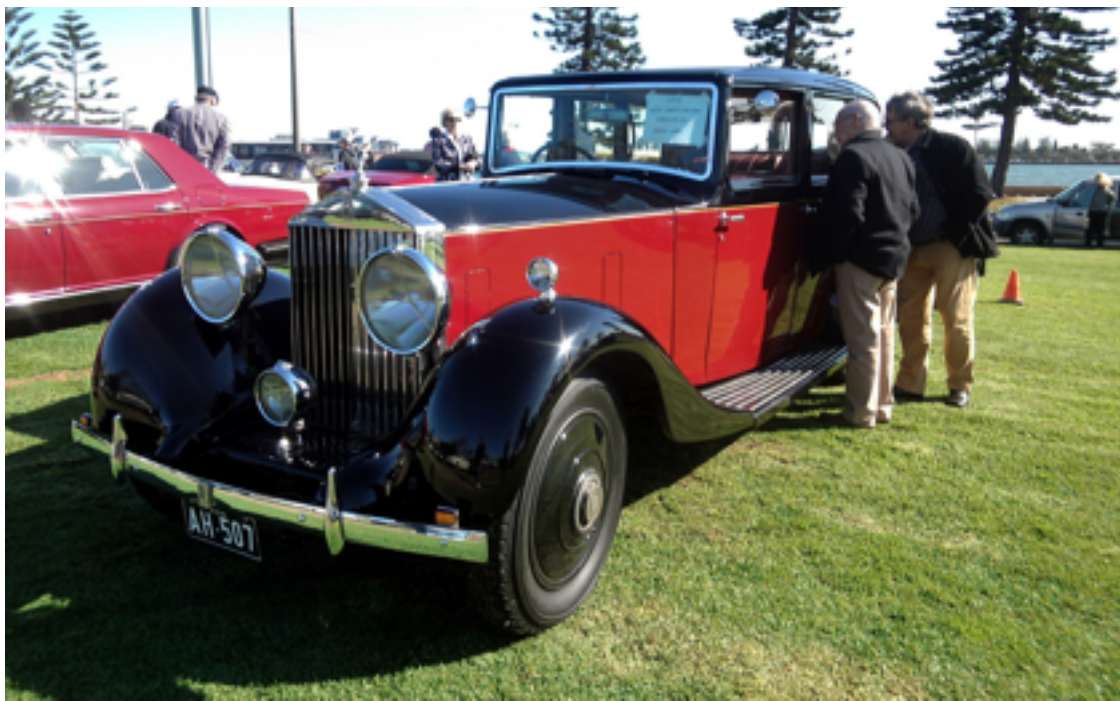
Below: An exquisite Rolls-Royce at the All British Day.