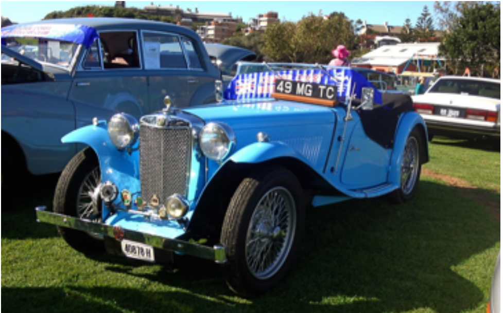
Above: An MG TC at the All British Day.