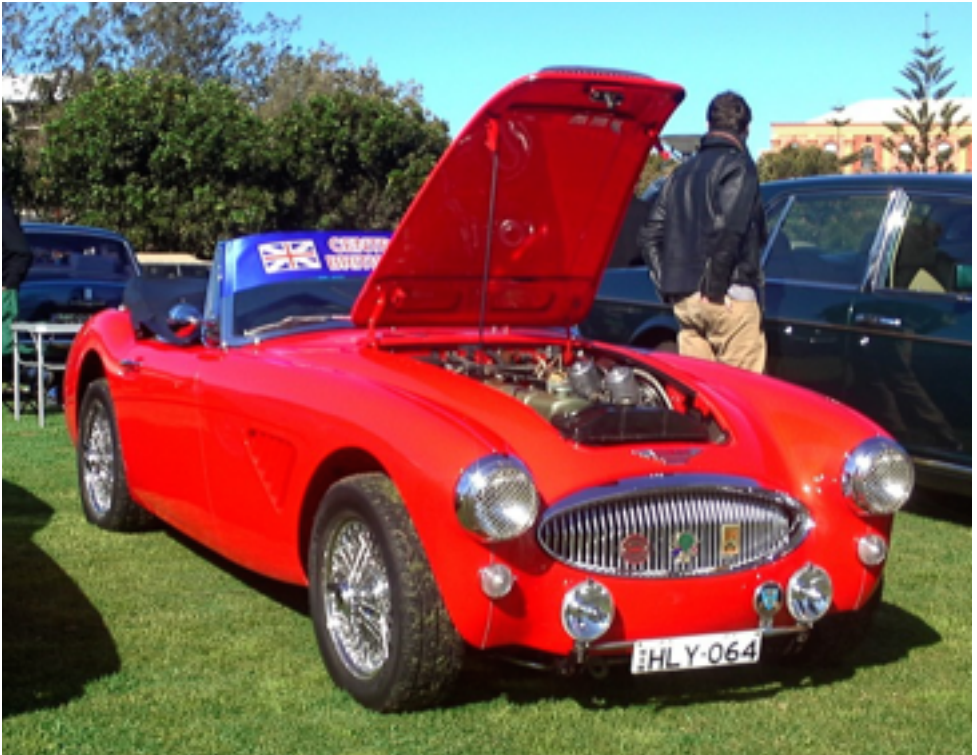
Below: An Austin Healey at the All British Day.