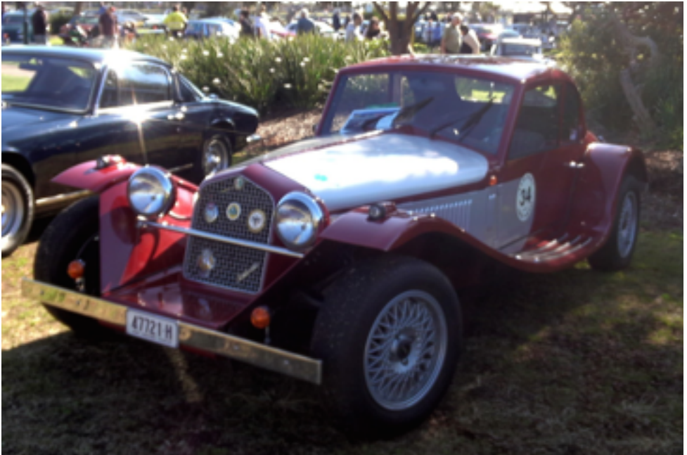
Above: An Alfa Romeo at the All British Day. Below: Jaguars on display at the All British Day.