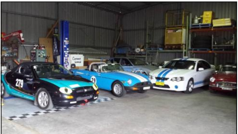
A garage that would be the envy of many