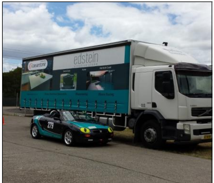
Wayne's daily driver next to the race car

That was Wednesday, we left on Saturday morning to head to the border to pick up the MGF. We had plenty of MX5's to choose from but I wanted something different