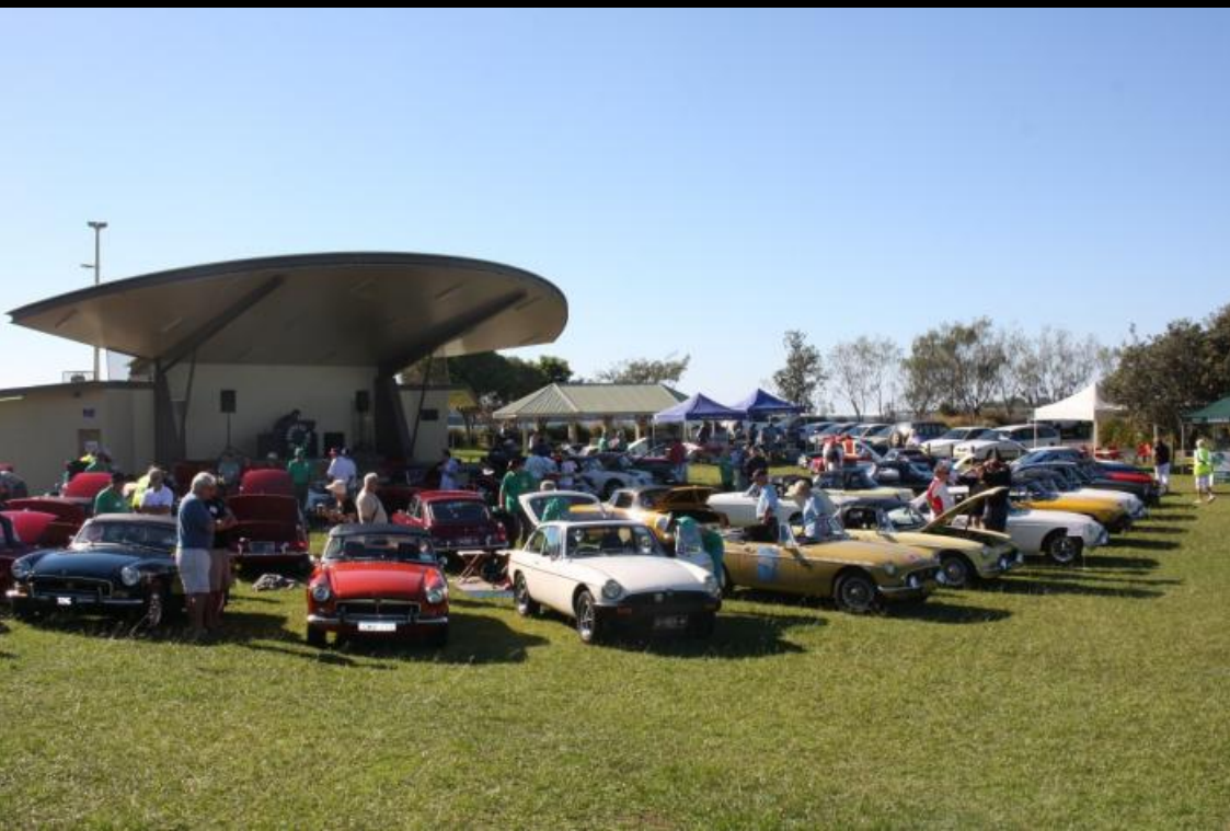
Above: MGB's being judged for the concours