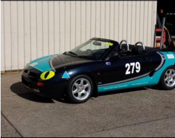
The F with new war paint applied

to the norm, and besides that we belong to the MG club.