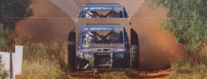
DUALY LED LIGHTS

NEW SHOWROOM 50 Waterview St, Carlton NSW 2218