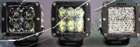
SR-SERIES LED LIGHTS