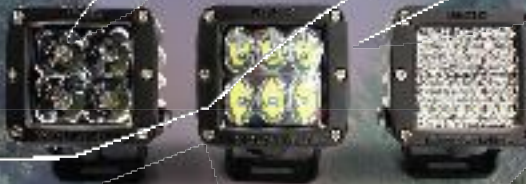
SR-SERIES LED LIGHTS