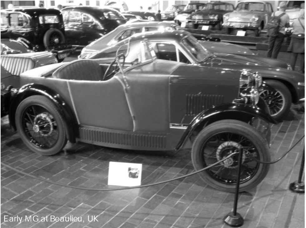
Early MG at Beaulieu, UK