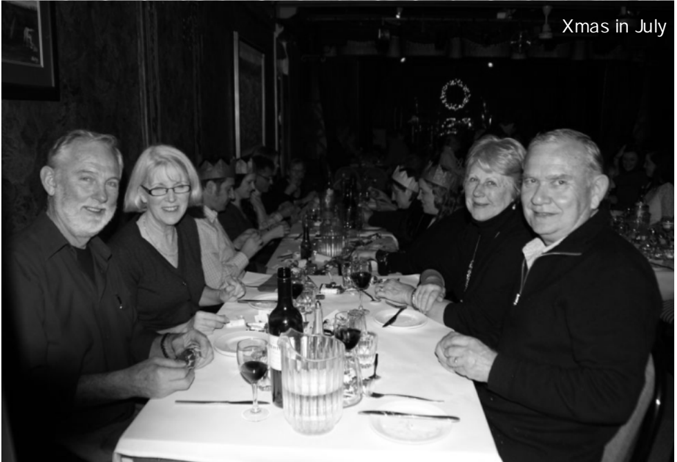
Xmas in July