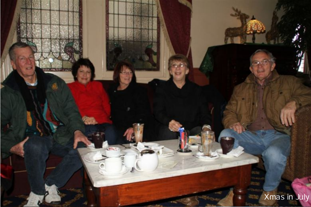
Xmas in July