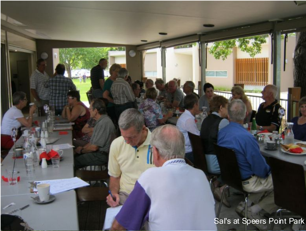
Sal's at Speers Point Park