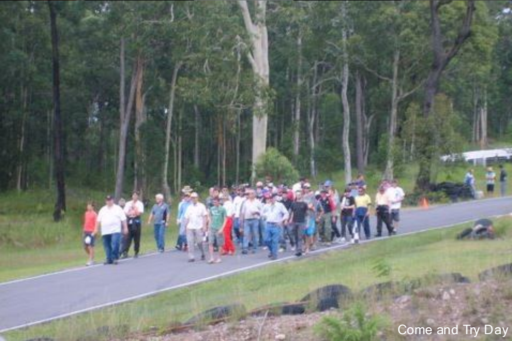
Come and Try Day