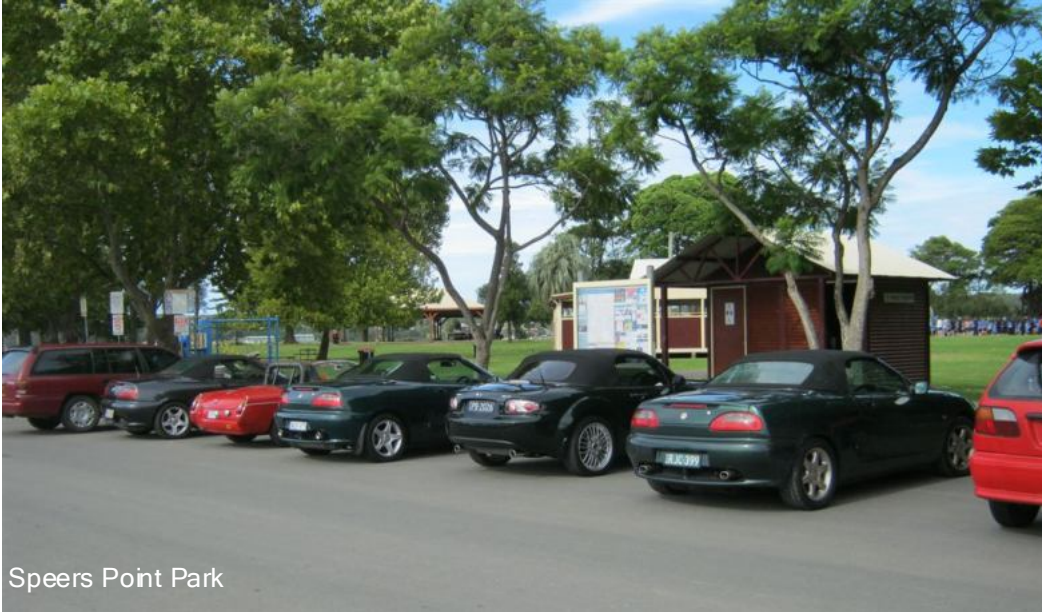
Speers Point Park