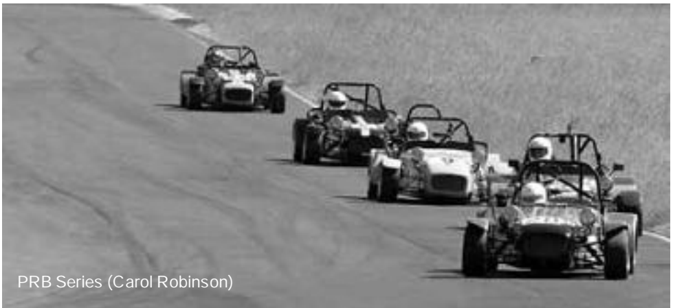
PRB Series (Carol Robinson)

The deadline for the next magazine is Friday 27th January 2012.