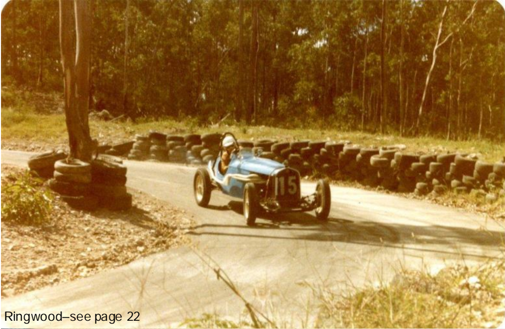
Ringwood—see page 22