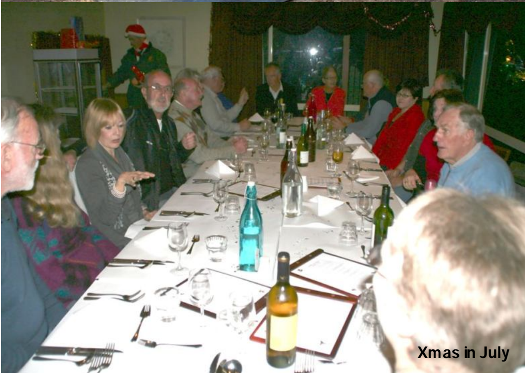
Xmas in July