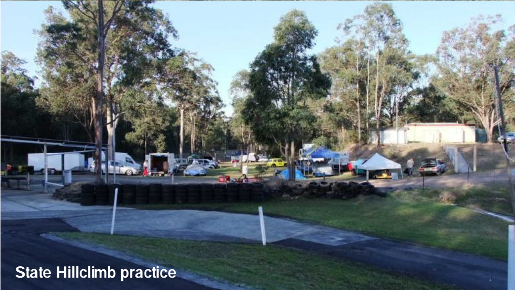
State Hillclimb practice