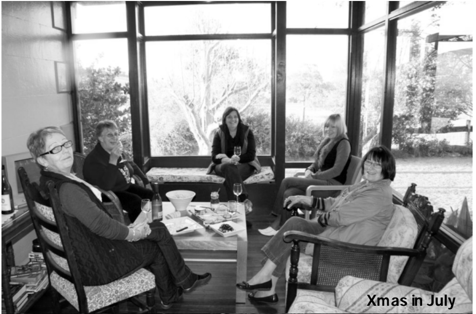
Xmas in July