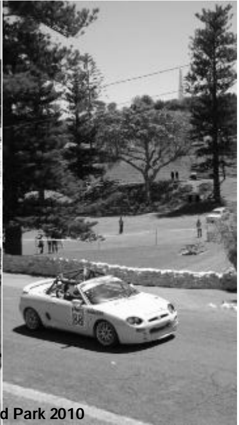
King Edward Park 2010