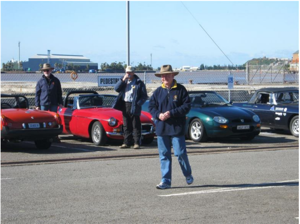
Left, Ringwood (MS), Stockton, above, Honeysuckle, below, Wakefield Park (RV)